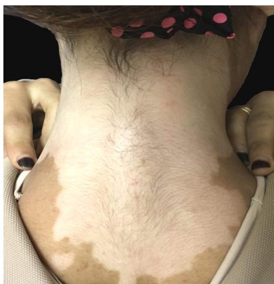
a. Before therapy