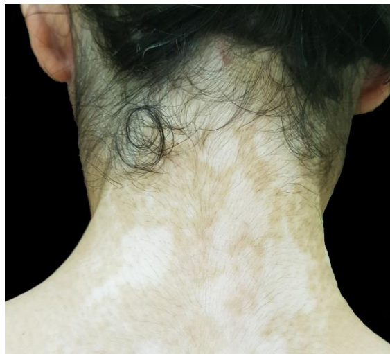
a. Before therapy