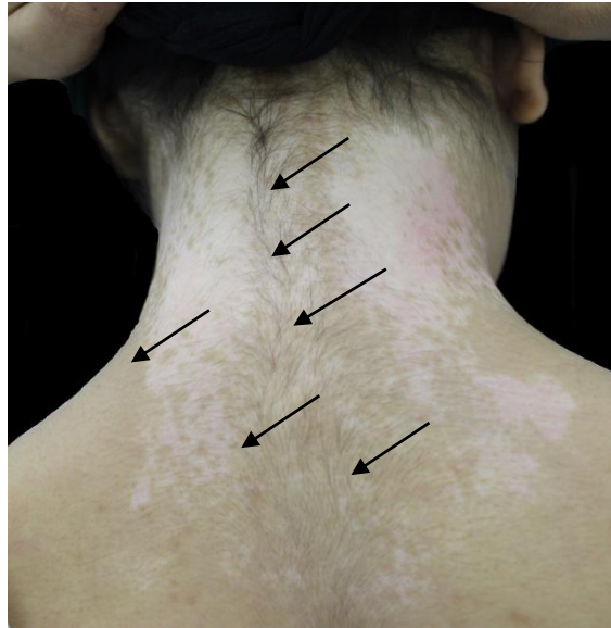
b. After therapy