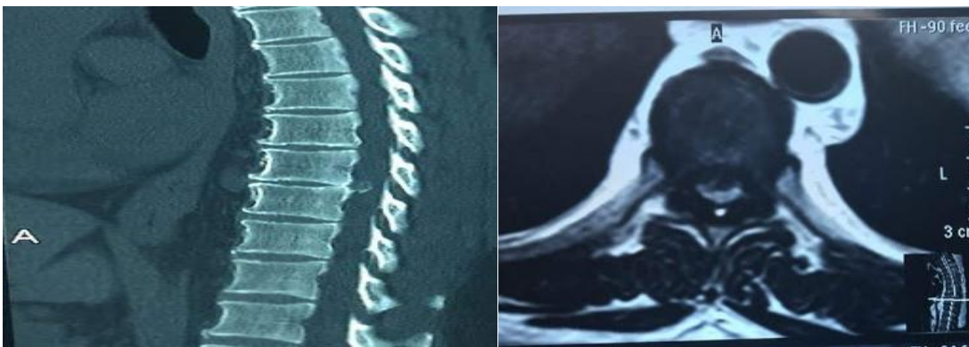
Fig 2. Midsagittal CT image and associated axial MRI images demonstrating a central calcified disc at T7-8 spinal level with occlusion of the canal.