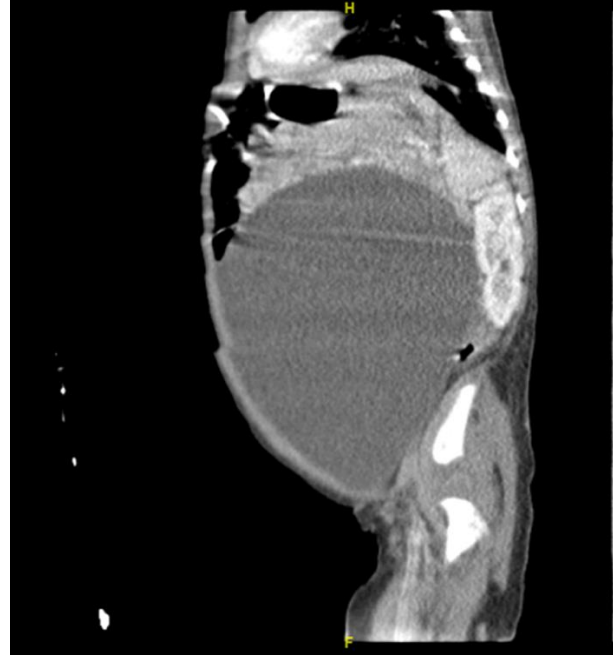
Figure (2): CT scan of the abdomen (Anteroposterior)